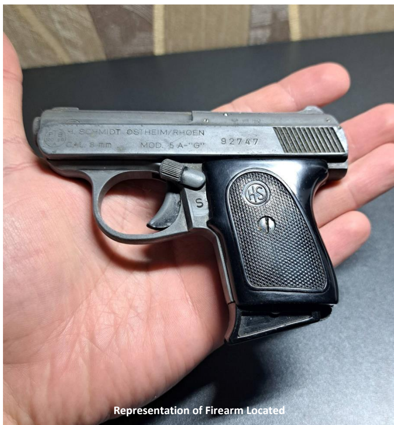
Representation of Firearm Located