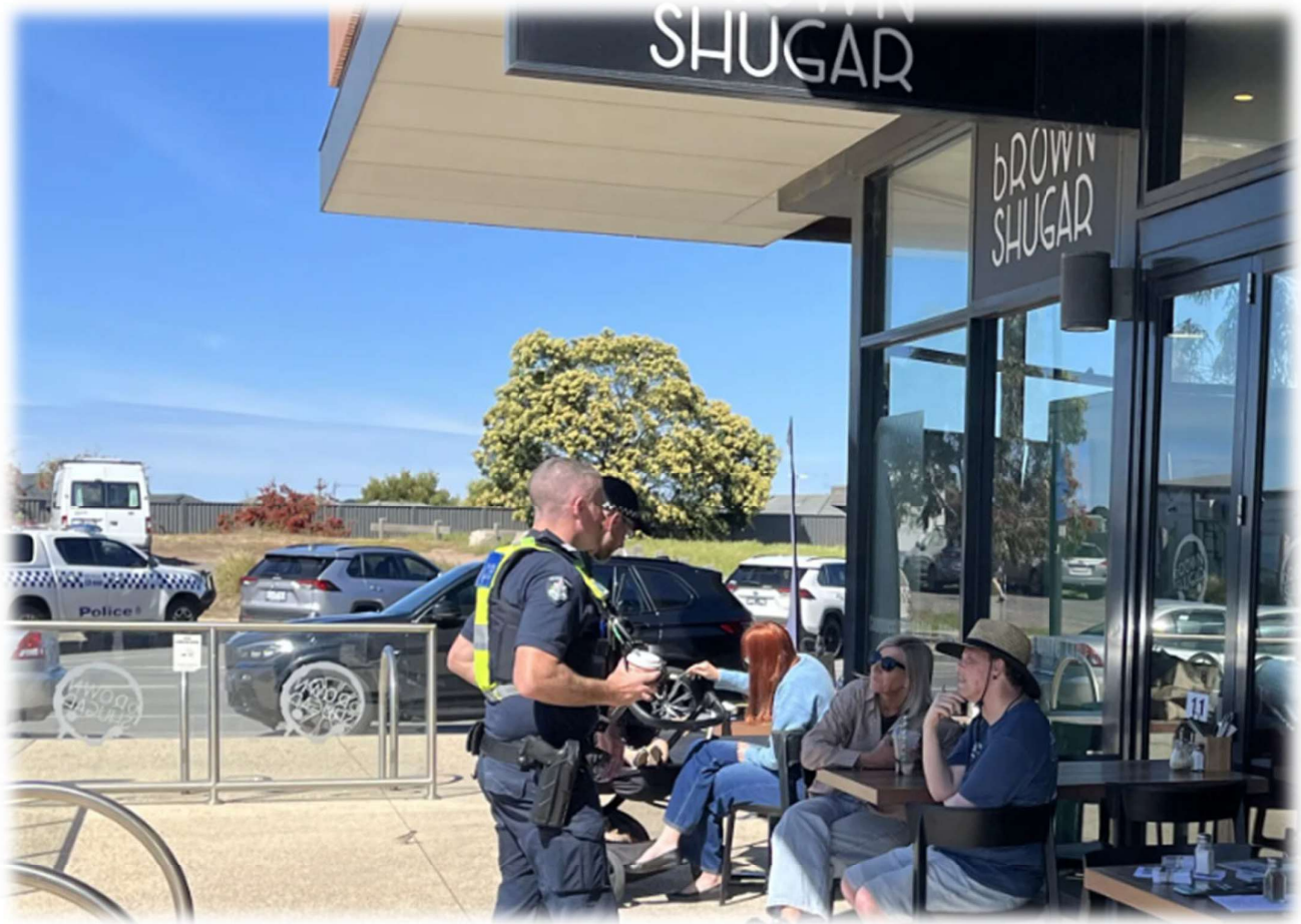
Coffee with a Cop at Brown Shugar in Curlewis on the 6 th of November.