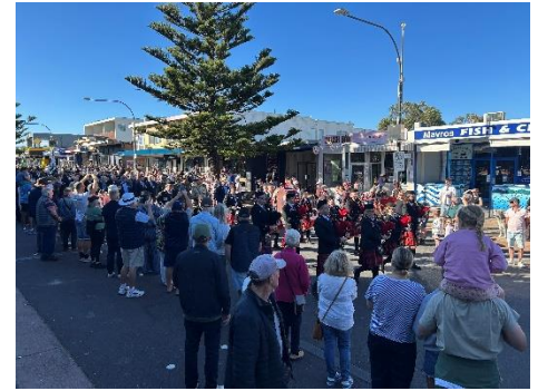
Ocean Grove Dawn Service and March